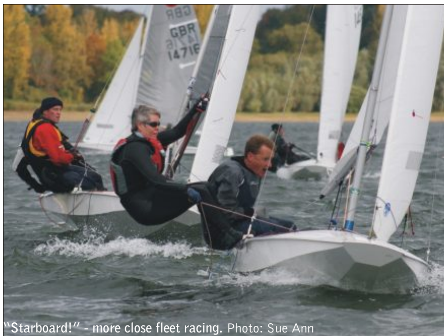
"Starboard!" - more close fleet racing.

Next up we have the two winter series, which run from November until the end of March or until the water runs out or goes solid. We like to keep