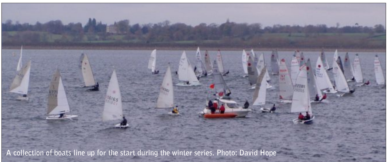
A collection of boats line up for the start during the winter series.