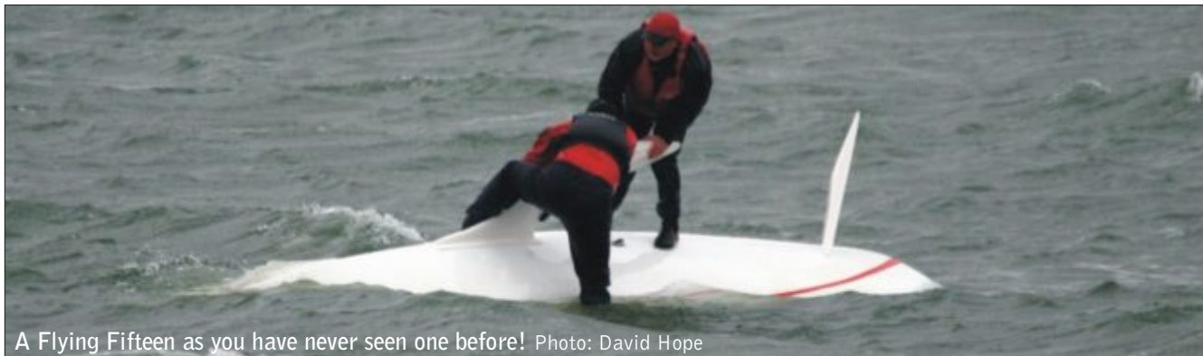
A Flying Fifteen as you have never seen one before!