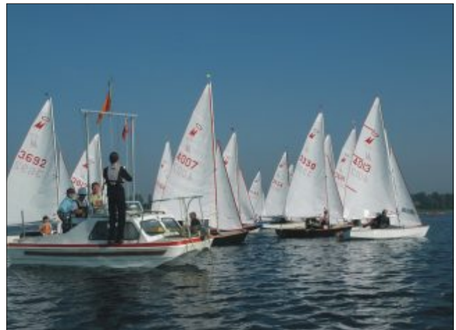
Miracles enjoy a slow start in the Draycote Open meeting.

28 Aug, 4 and 11 September – Fleet Championships (9 races, 5 to Count)