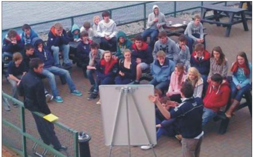
Debriefing on the patio during the 29er training weekend.