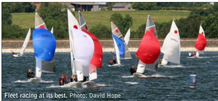
Fleet racing at its best.

Although the winter was absolutely and unremittingly rubbish for sailing, we have managed a few small successes. Firstly the fleet Christmas meal and prize-giving evening, which