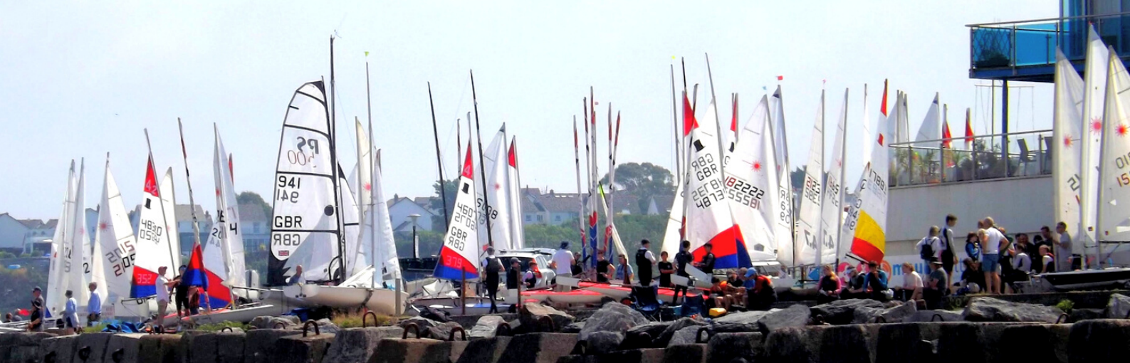
NSSA National Youth regatta